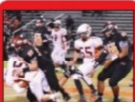
Football playoffs get underway Section B

Serving: Gonzales • Nixon • Smiley • Moulton • Shiner • Waelder • Yoakum • Luling • Flatonia • Hallettsville • Cuero • And More !